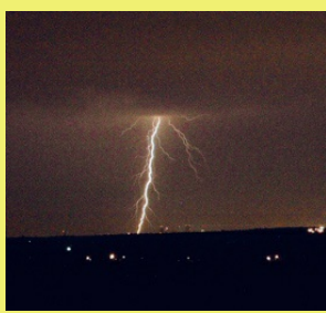
Nature's Fireworks